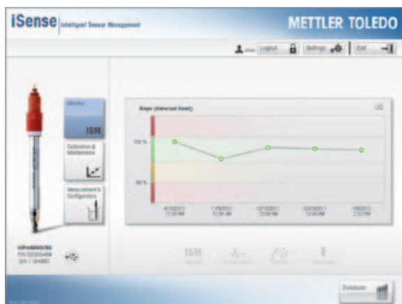
Fig. 3: The display of a pH sensor's slope or offset over time allows users to identify how process conditions have affected a sensor.

ISM is not only for pH measurement. Solutions for dissolved and gas oxygen as well as conductivity are also available. For safety critical processes, a range of in situ tunable diode laser gas analyzers combine exceptional ease of installation and use, with high accuracy and reliability.