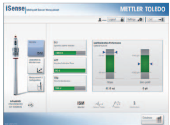
Fig. 2: The iMonitor display on iSense provides an easy to interpret overview of a sensor's condition.

Once an ISM sensor has been calibrated, it can be stored until required. Further, when connected to an ISM transmitter, the pre-calibrated sensor is instantly recognized and the transmitter