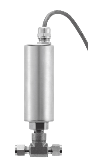
Figure 4: FS10A in tube tee

There are two major types of thermal devices on the market. One type utilizes a capillary bypass technique and is better known as a Mass Flow Controller or MFC. MFC's divert a portion of the main flow into a small bypass and sense the heat transfer of flowing fluid in the bypass channel. This technique can be very effective; however, the capillary tube is highly susceptible to contamination and clogging and should only be considered for use with clean or pre-filtered fluids. Capillary bypass flow