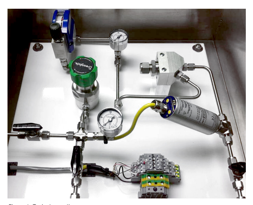
Figure 1: Typical sampling system

While there are a number of fluid flow monitoring technologies on the market, immersible thermal dispersion technology combined with packaging and sensor designs optimized for sampling systems has emerged as the new bestin-class technology. Thermal dispersion mass flow sensors have proven themselves for decades as extremely reliable in other demanding process and plant applications—often in relatively close proximity to analyzer systems.