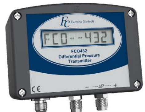
Figure 2. Furness FCO432 ultra low differential pressure transmitter

Get in touch with us for more information on our capabilities and find out how we can work together to deliver a successful project.