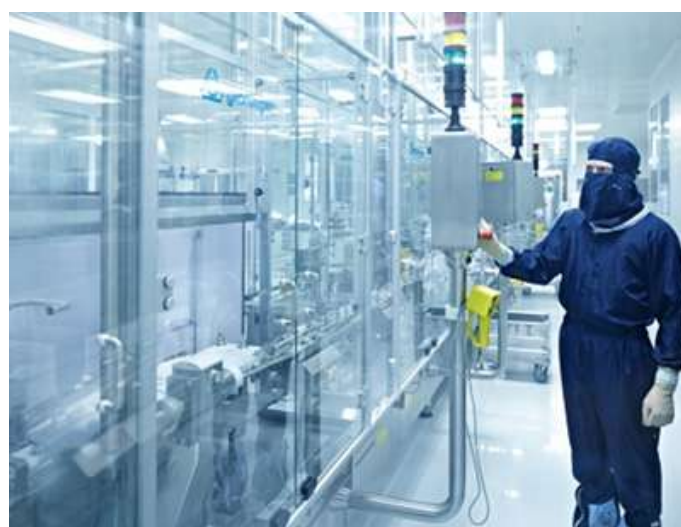
Figure 1. Cleanroom environment

Many cleanrooms are designed with a secondary space used for decontamination and pressurization when people are entering or leaving the space. Therefore, it is crucial to measure the air pressure in two separate areas of the cleanroom to indicate a difference in the readings.