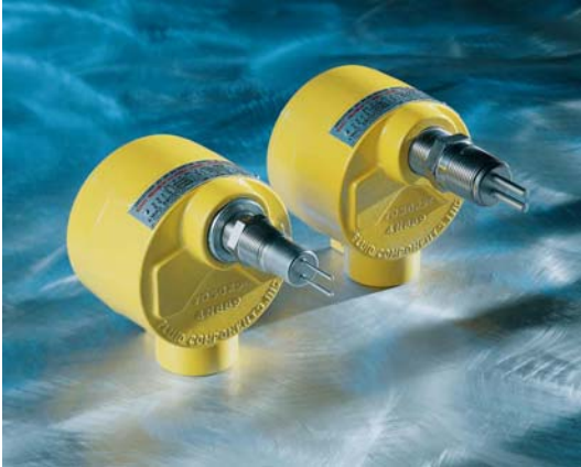
Fig 2. Flow Switch

Among the many types of point flow/level switches available is FCI's FlexSwitch® FLT Series, which offers dual alarm capability (Fig 2).