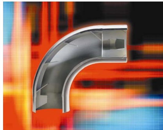
Fig 3. Flow Conditioner

If your plant is short on real estate with confined and non-ideal pipe configurations, the elbow flow conditioner (Fig 3) will eliminate all upstream straight run requirements for pumps, compressors, flow meters and other critical process equipment.