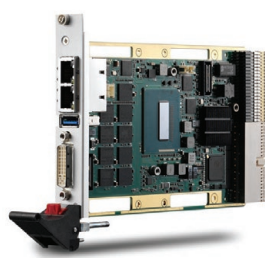
3U CompactPCI 4th Generation Intel® Core™ i7 Processor Blade with ECC for high performance PIS: cPCI-3510

ADLINK's intelligent transportation platforms are validated to meet or exceed rigorous transportation industry standards, ensuring non-stop performance under extreme environmental conditions. ADLINK's transportation platforms include CompactPCI (ideal for European and China markets), rugged single board computers (SBCs), Computer-on-Modules (COMs), Smart Panels and Matrix fanless embedded systems.