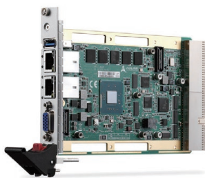
3U CompactPCI Quad-Core Intel® Atom™ Processor Blade for low power fanless system: cPCI-3620

ADLINK's rugged technologies are optimized for mission-critical train control and operation, networked security and safety, and high performance passenger infotainment. Our extensive roster of Rugged by Design board-level, box-level and user interface solutions provide reliability and flexibility across the spectrum of intelligent transportation systems – enabling high performance, faster time-to-market and reduced development costs for transportation system developers.