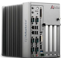
Intel® Atom™ processor E3845 Fanless Expandable Embedded Computer with PCI/PCIe Slots: MXC-2300

Supporting the specific requirements of high expansion capability for ITS applications, the MXC-2300 series, also from ADLINK's Matrix line, features the latest Intel® Atom™ E3845 processor, delivers impressive performance with minimal power consumption, sports exceptional 3D graphics, and powerful media acceleration. Features include built-in dual-port isolated CAN bus, accelerating inter-device communication, easily regulated functionality across multiple modules, versatile expandability from three PCI/PCIe expansion slots accommodating a variety of I/O cards, and ruggedized architecture guaranteeing extended operating temperature range of -20 to 70°C and operating shock tolerance up to 50 G in a remarkably compact enclosure. Experience an intelligent computing platform with levels of reliability, flexibility, and cost-effectiveness ideal for intelligent transportation systems.