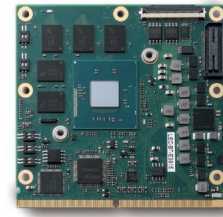
SMARC Full Size Module with Intel® Atom™ Processor E3800 series SoC: LEC-BT

ADLINK's intelligent transportation platforms are validated to meet or exceed rigorous transportation industry standards, ensuring non-stop performance under extreme environmental conditions. ADLINK's transportation platforms include CompactPCI (ideal for European and China markets), rugged single board computers (SBCs), Computer-on-Modules (COMs), Smart Panels and Matrix fanless embedded systems.